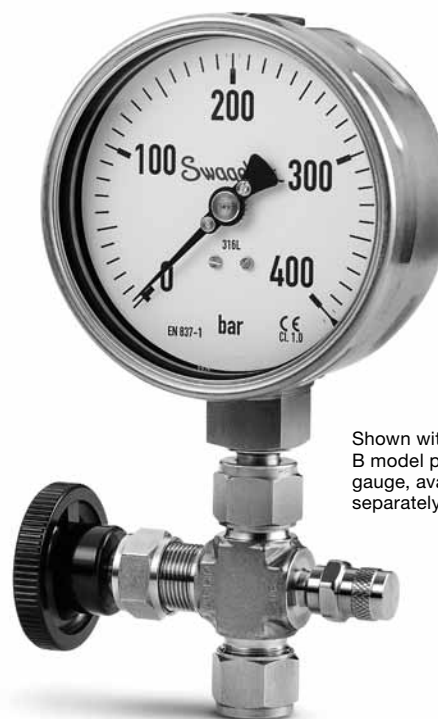
Shown with Swagelok B model pressure gauge, available separately.

⚠ Always open purge valves slowly. The vent hole rotates with the cap, changing the direction of discharge as the cap is turned. These valves contain no packing, so some fluid weepage will occur when the valves are opened. Operating personnel must protect themselves from exposure to system fluids.