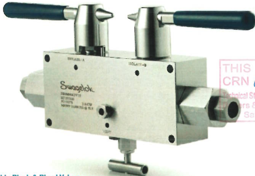
Double Block & Bleed Valves

THIS IS PART OF CRN 0C18171-5 Technical Standards & Safety Authority Pipes & Pressure Vessels Safety Program