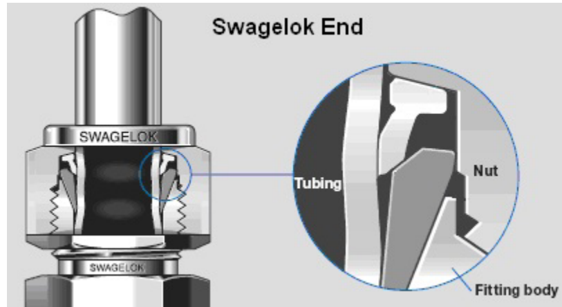
Cross-Section of Swagelok End connection

Swagelok Tube Fittings are furnished as straight or shaped fittings. Swagelok Tube Fittings consist of at least one Swagelok End – a proprietary two-ferrule mechanical-grip design.