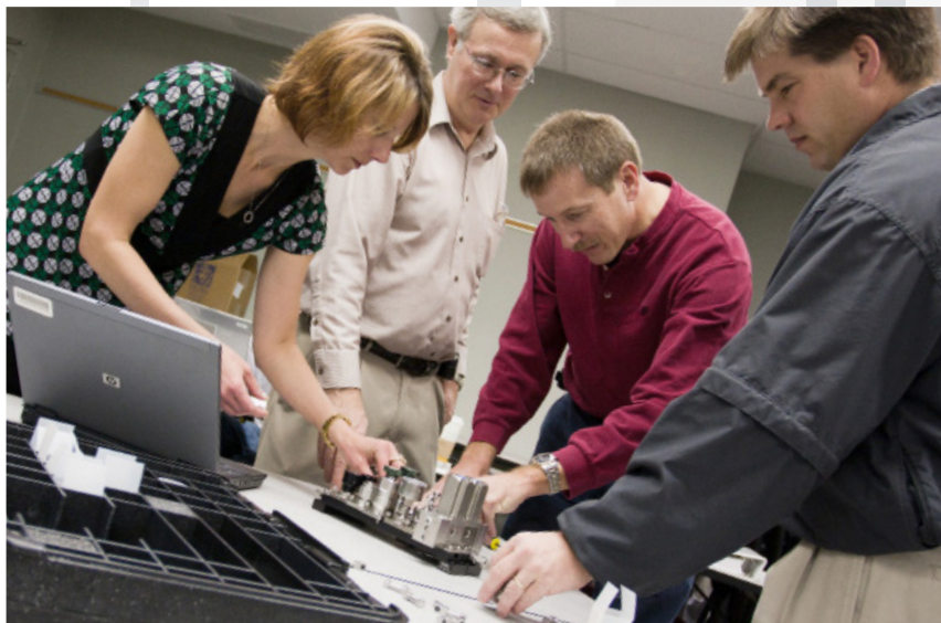
Students participate in an interactive exercise, designing and building a sampling system.

Learn more about PASS training at swagelok.com .