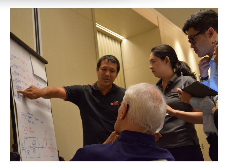
PASS Subsystem Training - Process Analyzer Sampling System Training - 5 business days @ 8 hours/day

Learn sampling system fundamentals and improve process accuracy. Design and build an optimized process analyzer sampling system that delivers timely and accurate results.