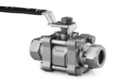
Swagelok Tube Fitting