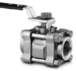
Female Pipe Thread