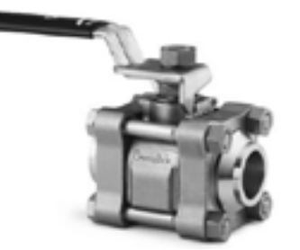
Pipe Butt Weld