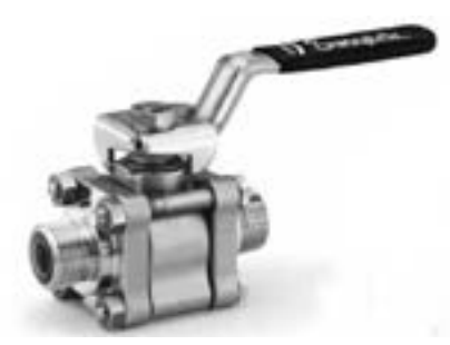
VCO O-Ring Face Seal Fitting