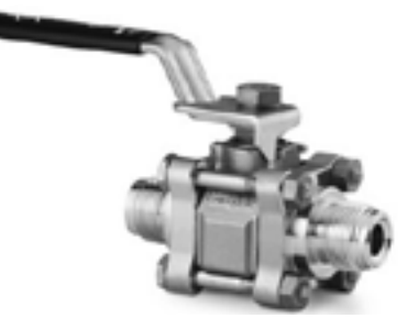
VCR Metal Gasket Face Seal Fitting