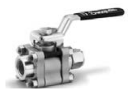
Female Pipe Thread to Swagelok Tube Fitting