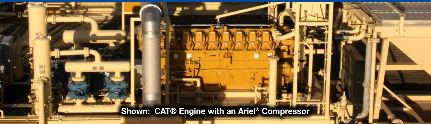
Shown: CAT® Engine with an Ariel® Compressor

Your Challenge: Severe Vibration Involving Engines/Compressors