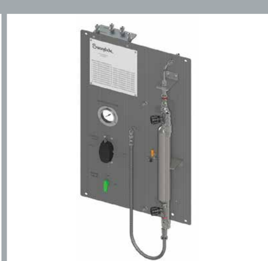
Grab Sample Systems