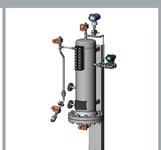
Seal Support Systems