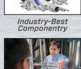
Unparalleled Application Knowledge