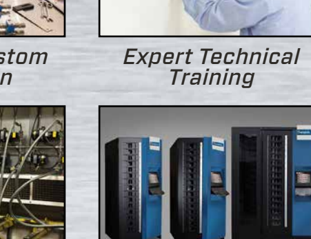
Proven Inventory Management Support