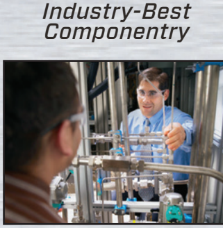
Unparalleled Comprehensive Application Knowledge Hose Advisories