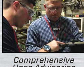
Comprehensive Hose Advisories