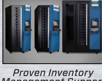
Proven Inventory Management Support