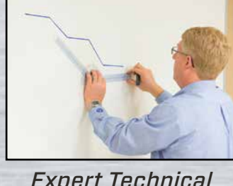
Expert Technical Training