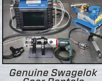
Genuine Swagelok Gear Rentals