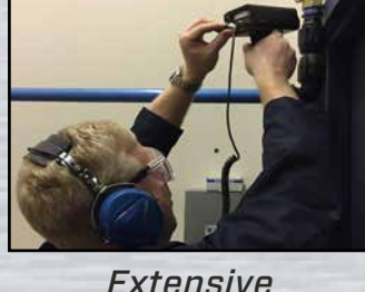
Extensive Energy Evaluations