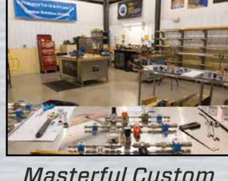
Masterful Custom Fabrication