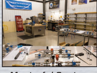
Masterful Custom Fabrication