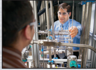
Unparalleled Application Knowledge