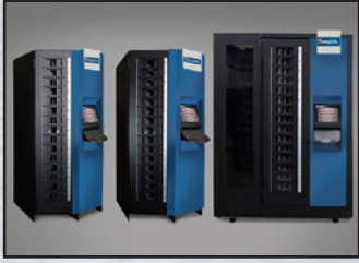
Proven Inventory Management Support