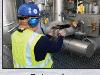
Extensive Energy Evaluations