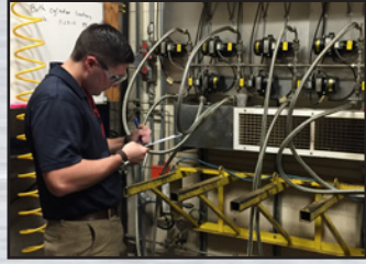
Comprehensive Hose Advisories