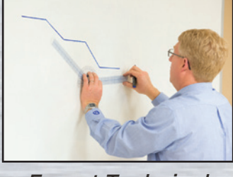
Expert Technical Training