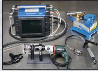
Genuine Swagelok Tool Rentals