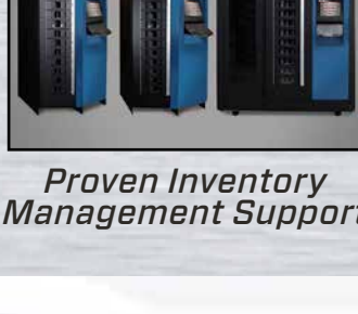
Proven Inventory Management Support