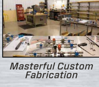
Masterful Custom Fabrication