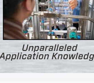
Unparalleled Application Knowledge