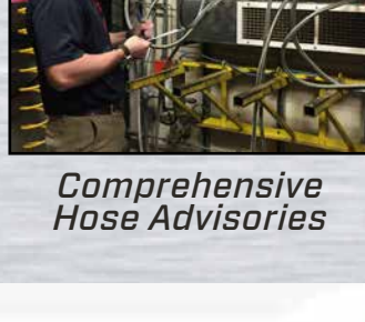
Comprehensive Hose Advisories