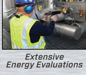
Extensive Energy Evaluations