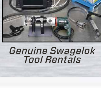
Genuine Swagelok Tool Rentals