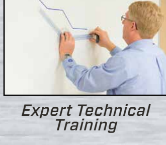
Expert Technical Training