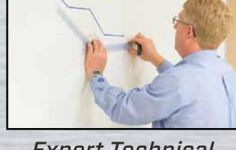
Expert Technical Training