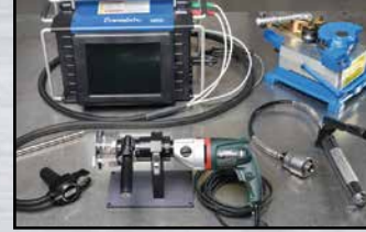
Genuine Swagelok Tool Rentals