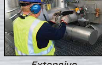
Extensive Energy Evaluations