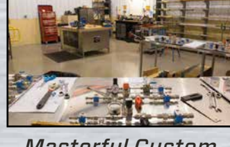
Masterful Custom Fabrication