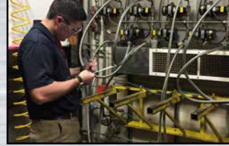
Comprehensive Hose Advisories