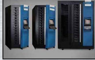
Proven Inventory Management Support