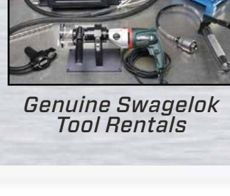
Genuine Swagelok Tool Rentals