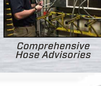
Comprehensive Hose Advisories