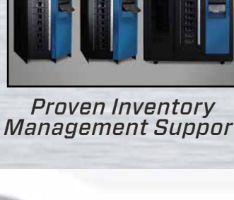
Proven Inventory Management Support