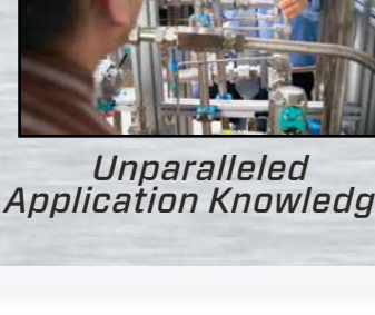
Unparalleled Application Knowledge