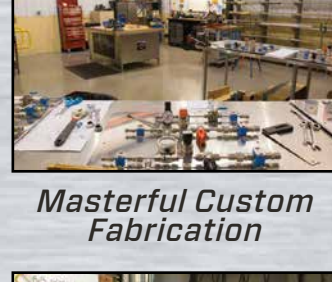
Masterful Custom Fabrication