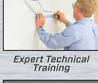
Expert Technical Training