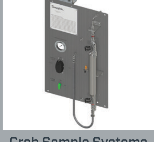
Grab Sample Systems