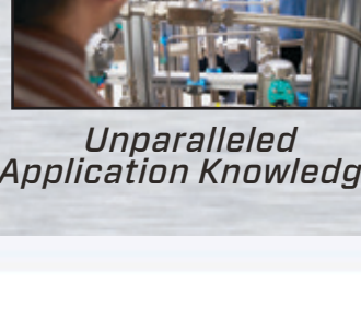
Unparalleled Application Knowledge