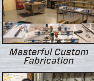
Masterful Custom Fabrication