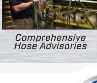
Comprehensive Hose Advisories