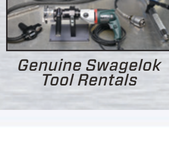
Genuine Swagelok Tool Rentals