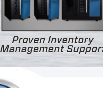
Proven Inventory Management Support