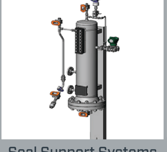
Seal Support Systems