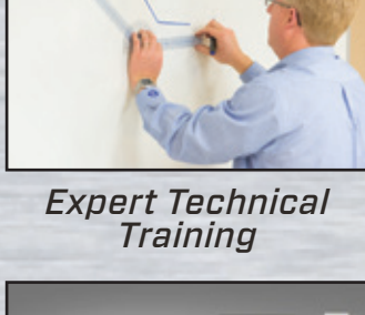
Expert Technical Training