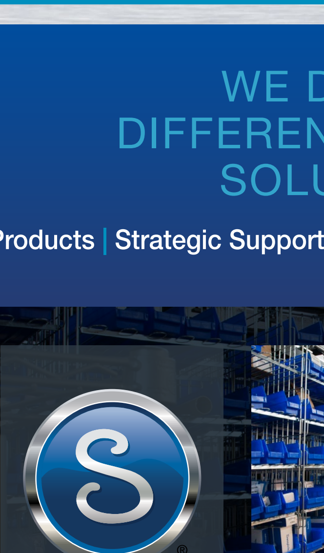
Industry-Best Masterful Custom Expert Safety Fabrication Training Componentry

and Strategic Support Services, contact: