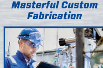
Comprehensive Hose Advisories