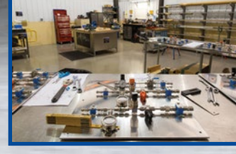
Masterful Custom Fabrication