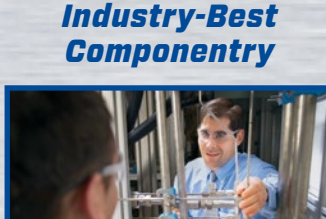
Unparalleled Application Knowledge