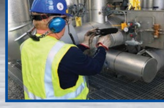
Extensive Energy Evaluations