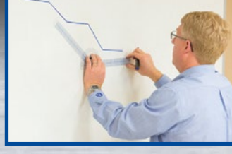
Expert Safety Training