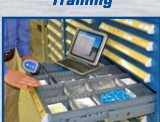
Expert Safety Training