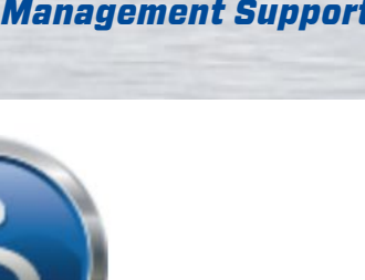
Proven Inventory Management Support