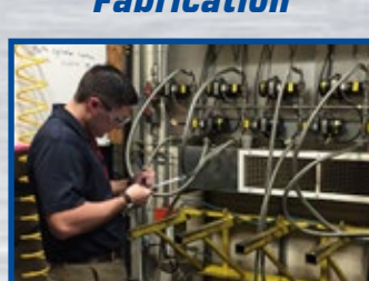
Masterful Custom Fabrication