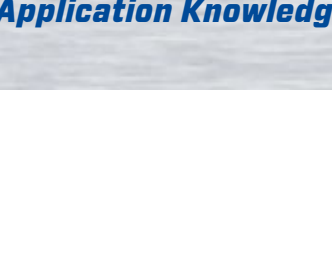
Unparalleled Application Knowledge