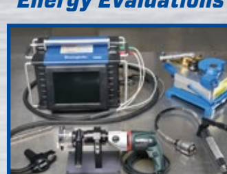
Extensive Energy Evaluations