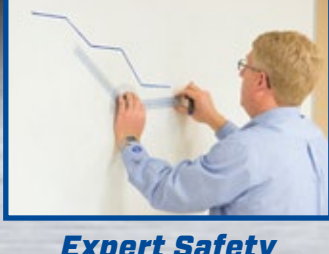
Expert Safety Training