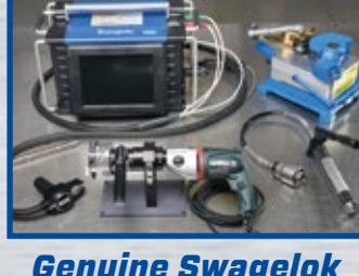
Genuine Swagelok Tool Rentals