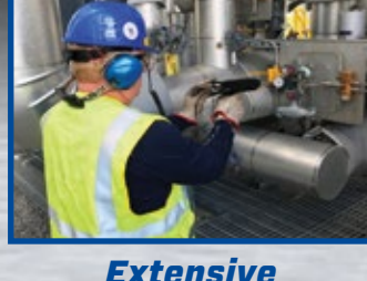
Extensive Energy Evaluations