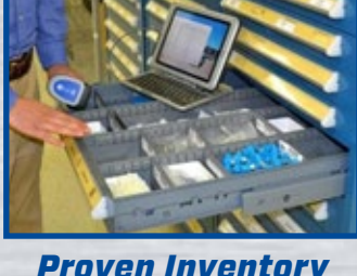
Proven Inventory Management Support