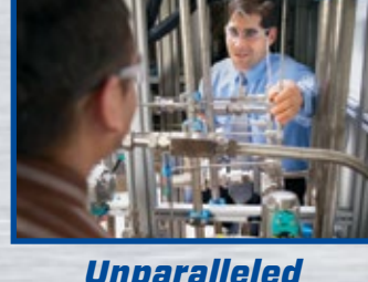
Unparalleled Application Knowledge