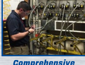
Comprehensive Hose Advisories