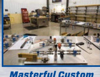
Masterful Custom Fabrication