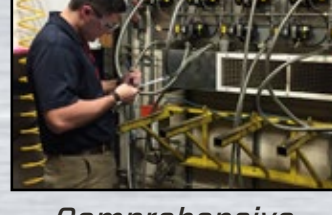
Comprehensive Hose Advisories