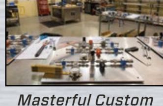
Masterful Custom Fabrication