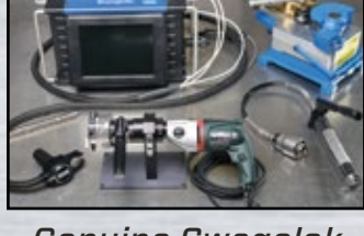
Genuine Swagelok Tool Rentals