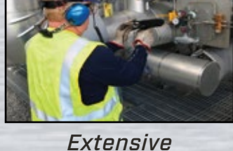
Extensive Energy Evaluations