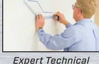
Expert Technical Training