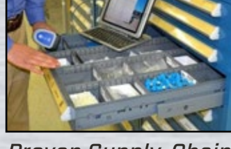
Proven Supply-Chain Support