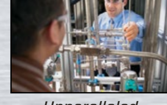
Unparalleled Application Knowledge