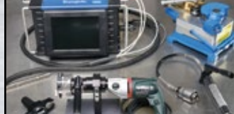
Genuine Swagelok Tool Rentals