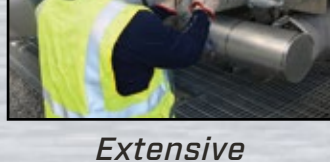
Extensive Energy Evaluations