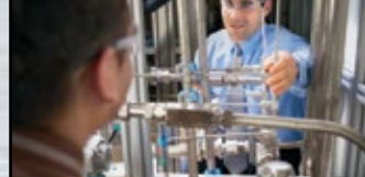
Unparalleled Application Knowledge