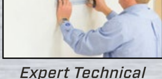
Expert Technical Training