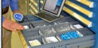
Proven Inventory Management Support