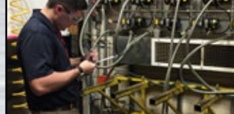
Comprehensive Hose Advisories