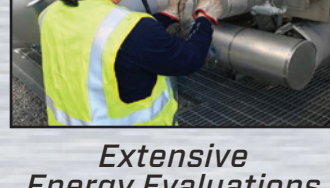
Extensive Energy Evaluations