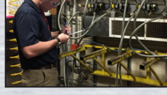
Comprehensive Hose Advisories