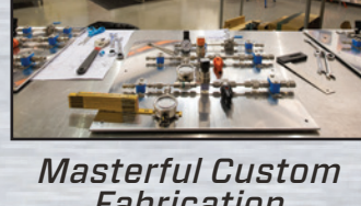
Masterful Custom Fabrication