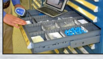
Proven Supply-Chain Support