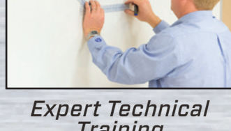
Expert Technical Training