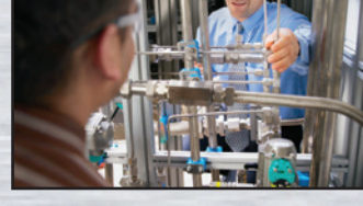
Unparalleled Application Knowledge