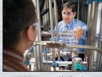
Unparalleled Application Knowledge