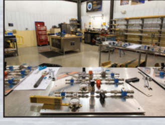
Masterful Custom Fabrication