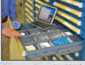
Proven Supply-Chain Support