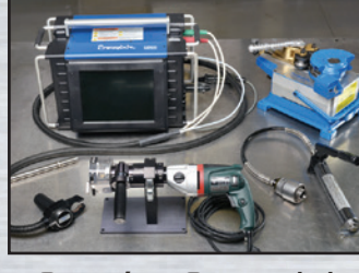
Genuine Swagelok Tool Rentals