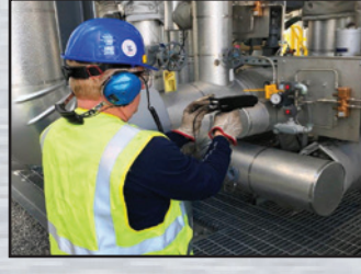
Extensive Energy Evaluations