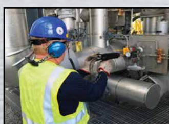
Extensive Energy Evaluations