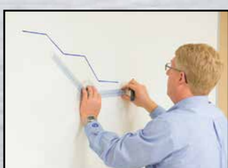
Expert Technical Training