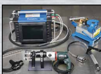
Genuine Swagelok Tool Rentals