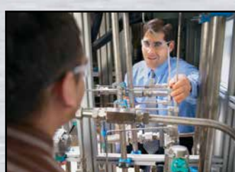
Unparalleled Application Knowledge