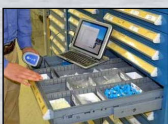
Proven Supply-Chain Support