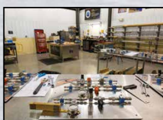
Masterful Custom Fabrication