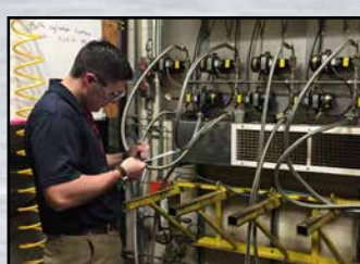
Comprehensive Hose Advisories