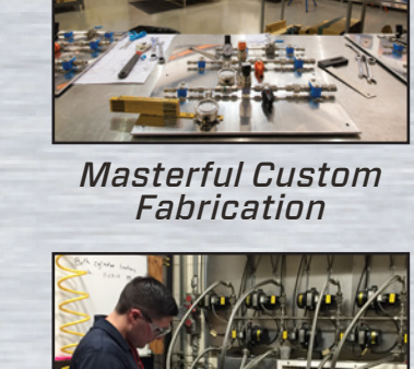
Comprehensive Hose Advisories