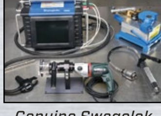
Genuine Swagelok Tool Rentals