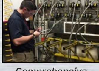
Comprehensive Hose Advisories