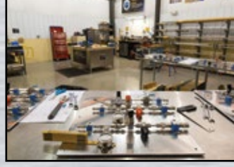
Masterful Custom Fabrication