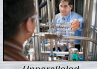
Unparalleled Application Knowledge