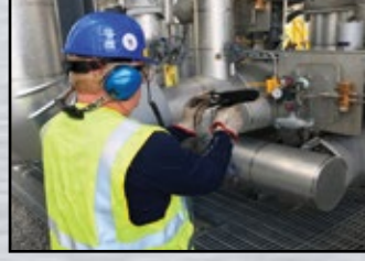
Extensive Energy Evaluations