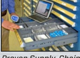
Proven Supply-Chain Support