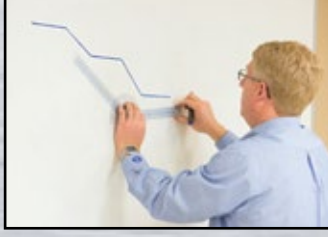
Expert Technical Training