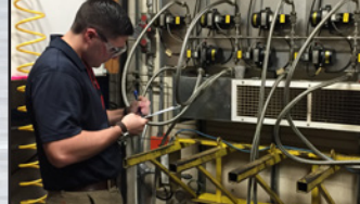
Comprehensive Hose Advisories