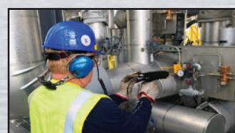
Extensive Energy Evaluations