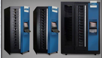
Proven Inventory Management Support