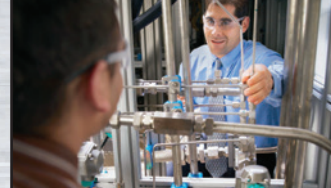
Unparalleled Application Knowledge