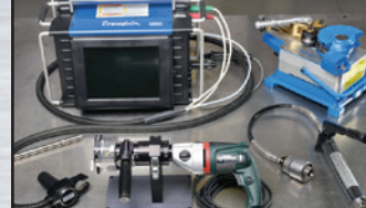
Genuine Swagelok Tool Rentals