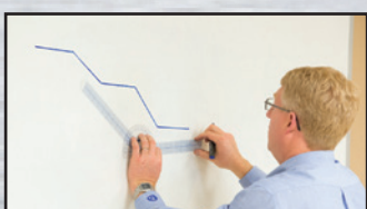
Expert Technical Training