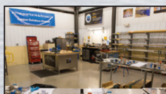
Masterful Custom Fabrication