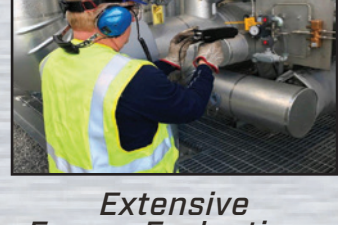
Extensive Energy Evaluations