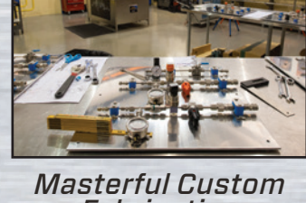
Masterful Custom Fabrication