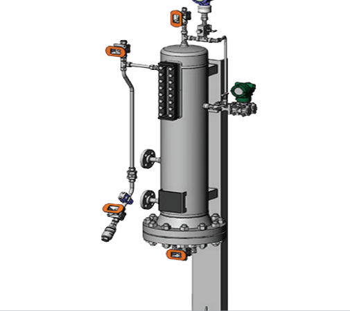
Seal Support Systems