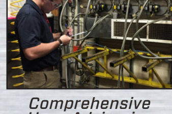
Comprehensive Hose Advisories