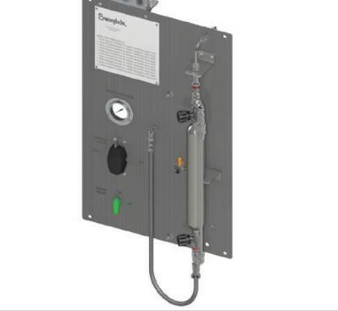
Grab Sample Systems