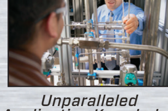
Unparalleled Application Knowledge