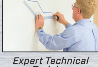
Expert Technical Training