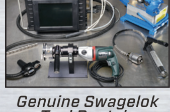
Genuine Swagelok Tool Rentals