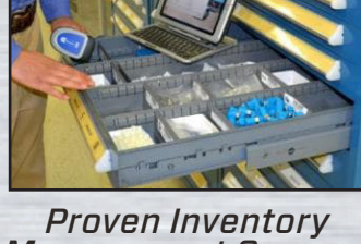
Proven Inventory Management Support