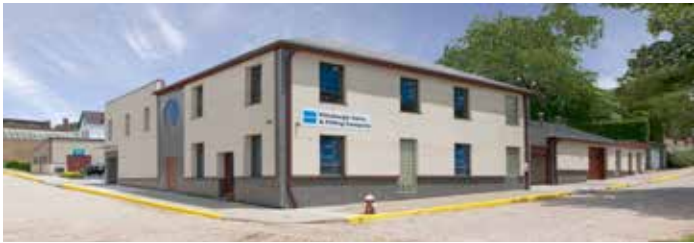
Swagelok Pittsburgh | Tri-State Area

Only Swagelok Pittsburgh | Tri-State Area offers such a powerful portfolio of premier Product Solutions and value-added Strategic Services to optimize your fluid system.