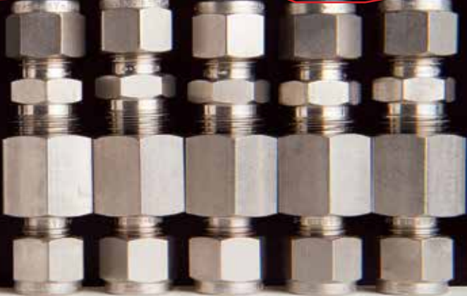
Competitive 3/8" Tube Fitting Assemblies

NPT 3/8" thread, finger-tight; Swagelok NPT male connection screwed into Swagelok female connection