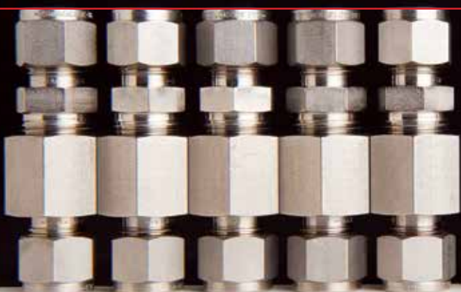
Swagelok 3/8" Tube Fitting Assemblies

NPT 3/8" thread, finger-tight; Swagelok NPT male connection screwed into Swagelok female connection