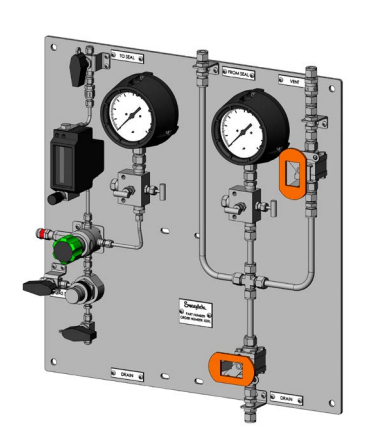
Between Seal Plans

All our seal support plans are designed using API 682-recommended best practices. Combined with Swagelok's fluid systems expertise, each design can be customized to be easy to use, easy to maintain, and safe to operate.