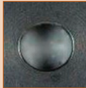
Treated 316L after 160 hours

In a saltwater solution, 316L stainless steel specimens treated with the SAT12 process showed no damage after one week, whereas untreated specimens showed damage within hours.