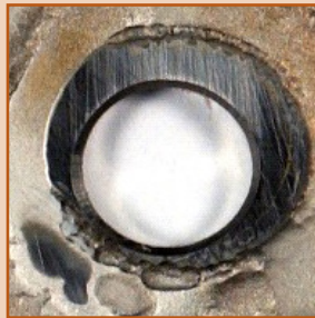
Untreated 316L after an hour