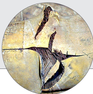
Excessive Cover Damage