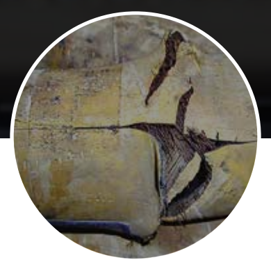
Excessive Cover Damage