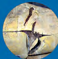
Excessive Cover Damage