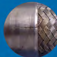
End Connection Damage