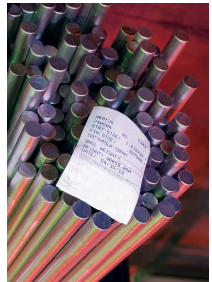
Quality Raw Material Barstock

Contact Your Authorized Swagelok Sales & Service Centre: