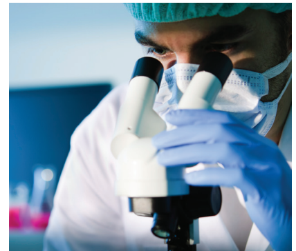
Quality Swagelok Associates Check Every Detail