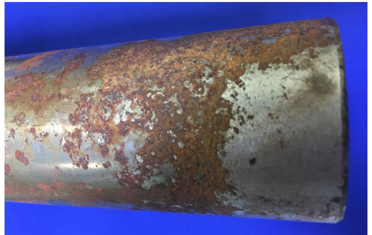
Exterior of Suspect Tubing which is Corroding

There is an indication that the item may not conform to the accepted standards, specifications or technical requirements.