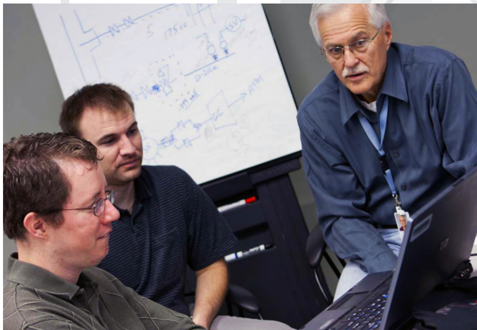
Students participate in an interactive exercise, learning to troubleshoot a sampling system.

Our Sampling System Problem Solving and Maintenance Training (SSM) teaches fundamental and advanced practices in analytical instrumentation operation and maintenance, empowering you to maintain your sampling system with minimal error and greater system integrity.