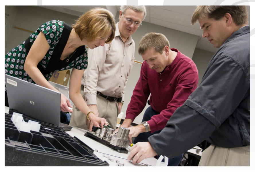
Students participate in an interactive exercise, designing and building a sampling system.

<u>Learn more about PASS</u> <u>training at swagelok.com.</u>