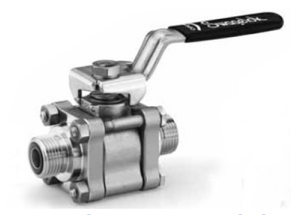
VCO O-Ring Face Seal Fitting