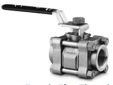
Female Pipe Thread