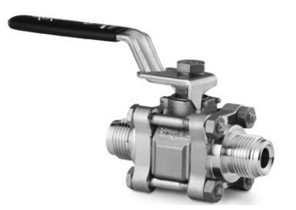
VCR Metal Gasket Face Seal Fitting