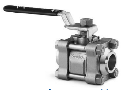
Pipe Butt Weld