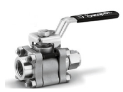
Female Pipe Thread to Swagelok Tube Fitting