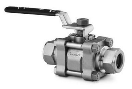
Swagelok Tube Fitting