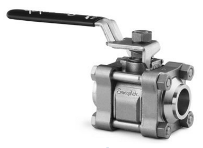
Tube and Pipe Socket Weld