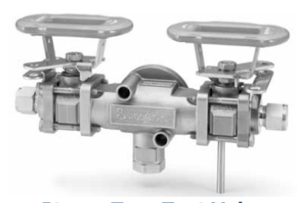
Steam Trap Test Valve

Consists of two 63 series ball valves and a universal mount. Steam trap is not included.