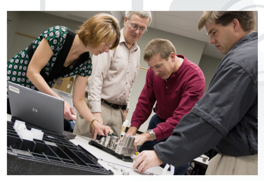
Students participate in an interactive exercise, designing and building a sampling system.

<u>Learn more about PASS</u> training at swagelok.com.