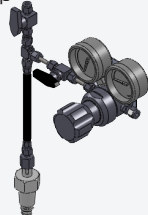
Cylinder Gas Regulator with Purge Setup