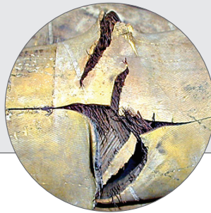
Excessive Cover Damage