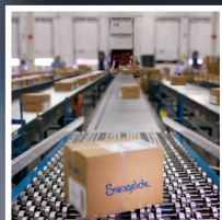
LOGISTICS & SUPPLY CHAIN